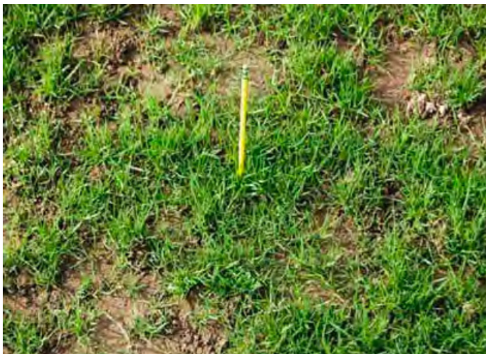
PERENNIAL RYE UNTREATED CONTROL