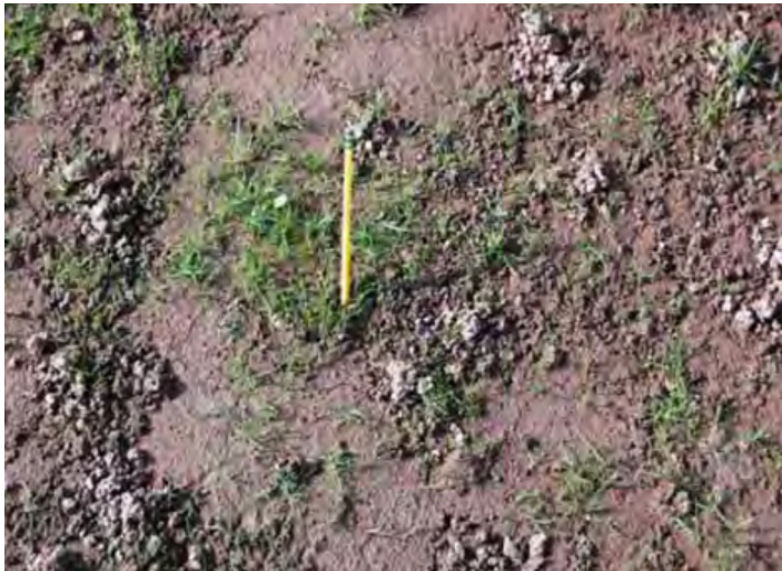
KENTUCKY BLUE GRASS UNTREATED CONTROL