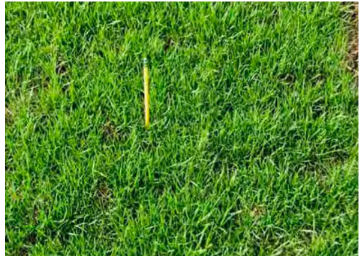
ULTRABIND TREATED PERENNIAL RYE