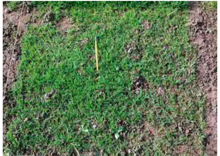
ULTRABIND TREATED KENTUCKY BLUE GRASS